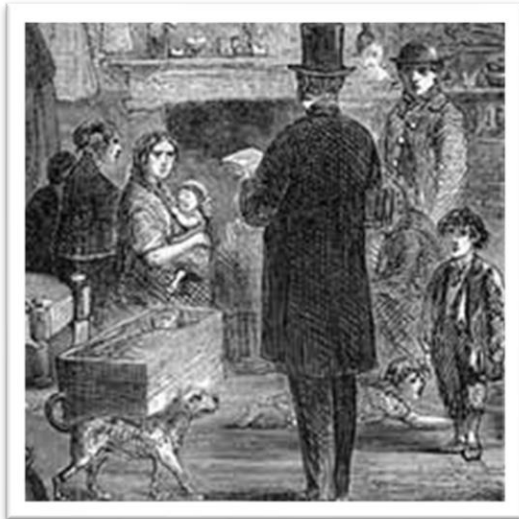
A census enumerator in a Gray's Inn Lane tenement, London